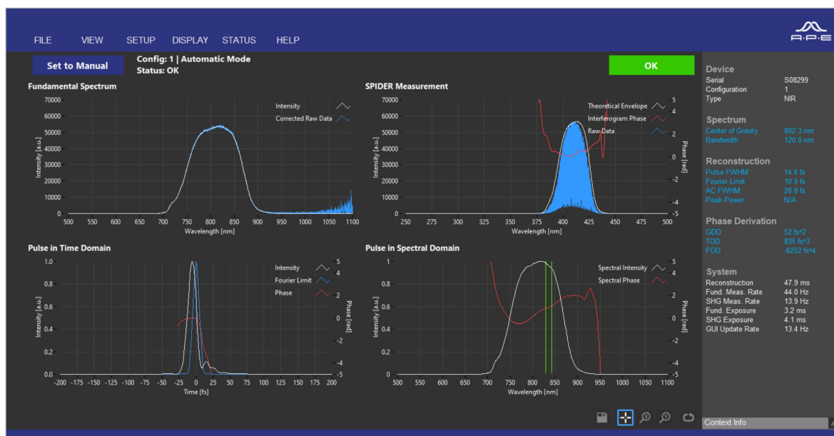
Software Interface FC Spider and Spider

Important software features for advanced pulse characterization are provided with all APE Spiders. If desired, a PC or notebook with pre-installed software can optionally be delivered together with the instrument.