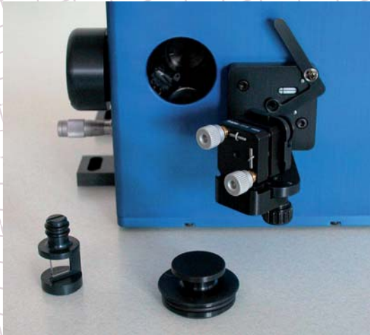
Easy crystal change